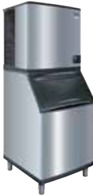
i-1106 A-570 Bin