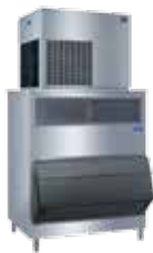
RF-2300 F-1300 Bin