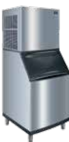
RNS-1000 † A-570 Bin