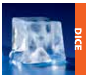
Available on all undercounters