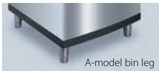
A-model bin leg