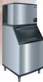
i-606 A-570 Bin