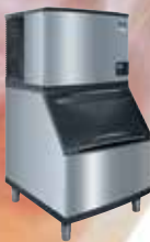
i-500 A-400 Bin