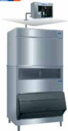
S-3070 F-1300 Bin