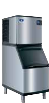
i-322 A-320 Bin