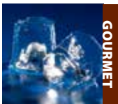
Available on U-310