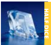
Available on U-140, U-190, U-240, and U-310

These compact ice cube machines are ideal for small-volume ice production, for limited-use needs, or as back-ups for larger machines. Specifically designed to fit beneath counters or in areas where floor space or height restrictions prohibit use of larger equipment. The petite size makes any of these models ideal for on-the-spot installations at coffee shops, stadium boxes, refreshment/break areas, or wherever limited ice needs require equipment with a small footprint.