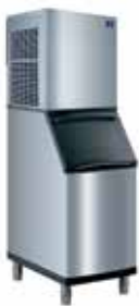
RNS-0308 † A-420 Bin