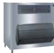
F-1650 (ex factory)