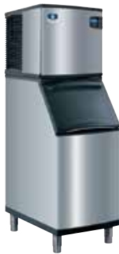
i-522 A-420 Bin