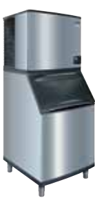
i-906 A-570 Bin