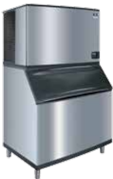
i-1800 A-970 Bin